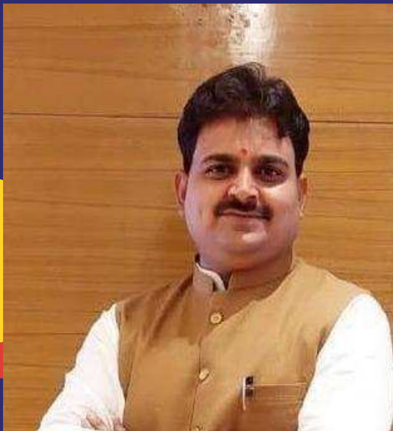
Dept. of Teacher Education