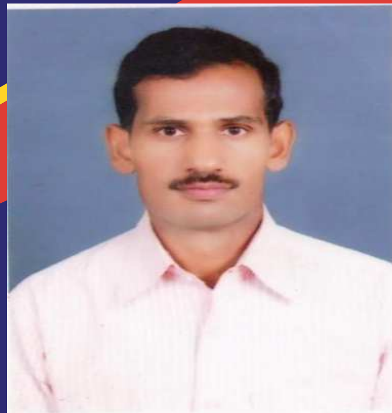
Dept. of Teacher Education